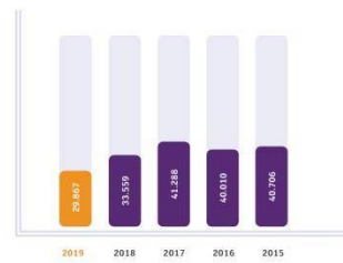
Pembiayaan Financing (Dalam miliar Rupiah/in billion Rp)